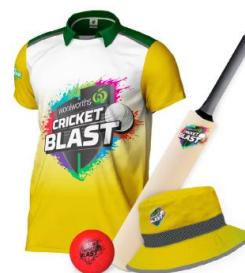
Junior Blasters KIT