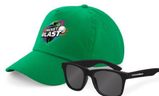
Master Blasters KIT

The club will also be fielding multiple junior cricket teams across all age groups